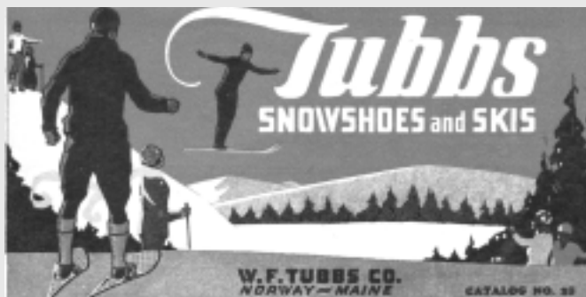
W.F. Tubbs Catalogue cover

Ski manufacturing was an important segment of Maine's woodworking industry in the early 1900s. Paris Manufacturing Company started making skis in 1900 and W.F. Tubbs, a competitor in neighboring Norway, was also an important factor. An official history of Norway, published in 1922, stated that W.F. Tubbs was producing 60,000 pair of skis per year. Researching the fascinating story of ski manufacturing in our state is an important part of the Museum's "Made In Maine" project.